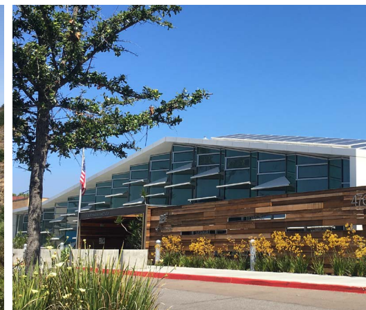
The SDG&E Energy Innovation Center in Clairemont is a community resource that is part of the picture towards reducing energy to address climate change.