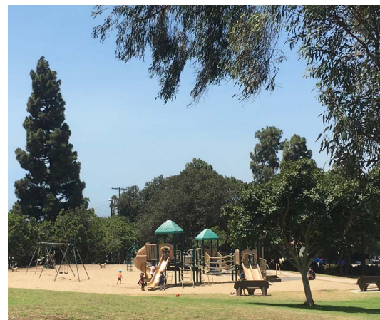
Parks are a critical component of our community's infrastructure and quality of life.