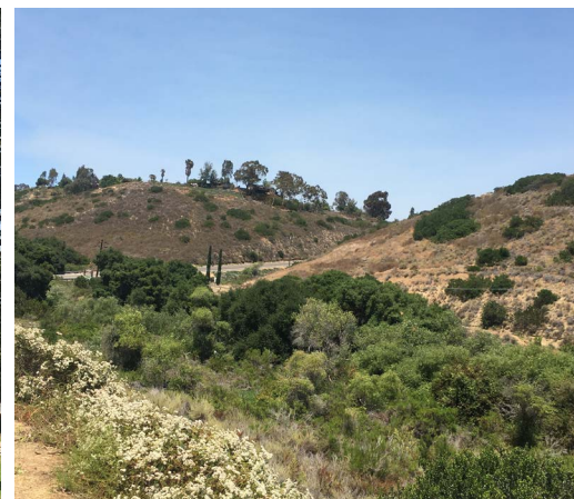
Preserving our open space areas is important to maintaining community character and quality of life.